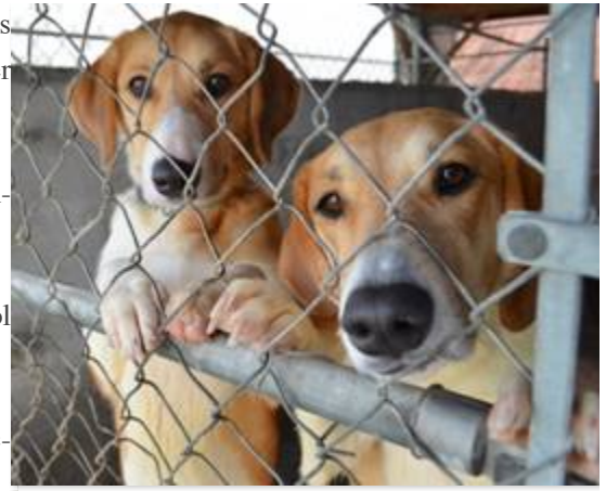
( http://watchdog.wpengine.netdna-cdn.com/wp-content/blogs.dir/1/files/2013/05/Puppies.jpg )

Like Watchdog.org? Click HERE to get breaking news alerts in YOUR state! ( http://watchdog.org/subscribe )